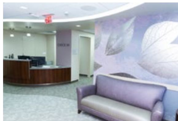
Above: Expanded Maternal Fetal Medicine Center

The Hospital of Central Connecticut opened its expanded Maternal Fetal Medicine (MFM) program space to meet the increased need for high-risk prenatal testing. The new and expanded 2,390-square-foot area includes additional exam and procedure rooms on the New Britain campus. The new space boasts three ultrasound examination rooms as well as three non-stress test fetal monitoring procedure areas. MFM physicians, genetic counselors, and a team of sonographers use state-of-the-art ultrasound techniques, genetic testing, and procedures such as chorionic villus sampling, amniocentesis, and fetal echocardiography to diagnose and monitor complications in pregnancy.