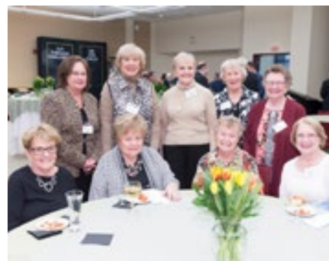
HOCC Bradley Memorial Auxiliary