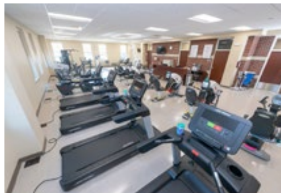
At left: Expanded Cardiac Rehabilitation Center