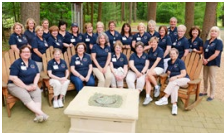
At right, HOCC Auxiliary at New Britain General Board Members and Golf Committee volunteers

Special thanks to our major sponsors of the 2019 Auxiliary Golf Tournament.