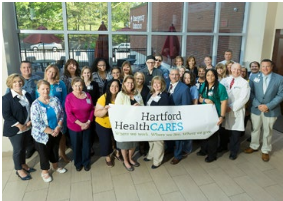
Together we made a difference.