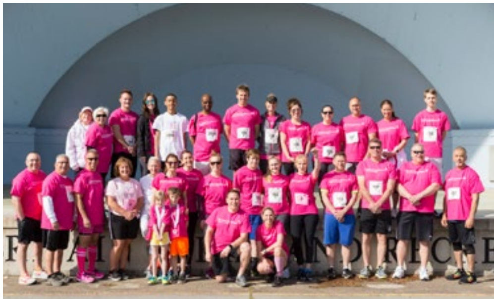
Central Region Gets Fit team at the Race in the Park

Central Region Gets Fit, a community of colleagues from The Hospital of Central Connecticut and MidState Medical Center dedicated to getting and staying fit together, participated in the 2019 CT Breast Health Initiative Race in the Park at Walnut Hill Park in New Britain. Fifty-five team members participated, raising $3,260 for the CT Breast Health Initiative, which supports breast cancer research across the state of Connecticut. This year's CT Breast Health Initiative Race is May 9, 2020. Please visit www.ctbhi.org to register.